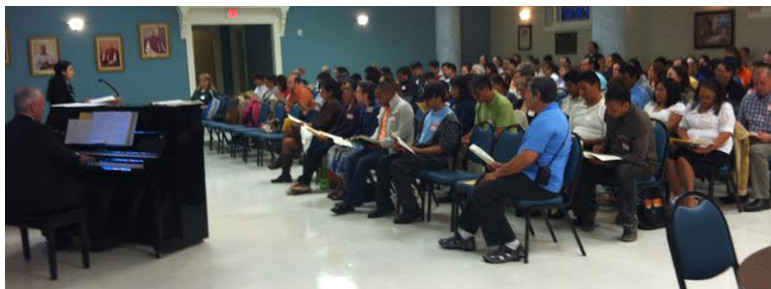
NPM Chapter, Diocese of Arlington, Virginia